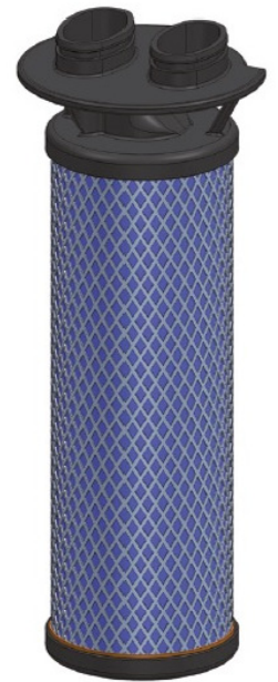
Depth filter V